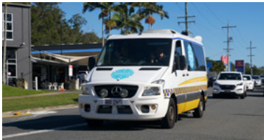
Non-emergency Patient Transport Officer

Here are some of the most popular career outcomes :