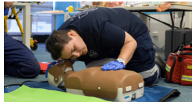
Emergency First Aid Responder