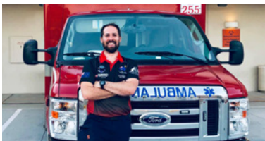
Private Hospital Patient Transport Officer