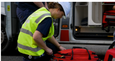
Basic Life Support Medic (BLS)

Here are some of the most popular career outcomes :