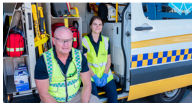
Ambulance Support Officer