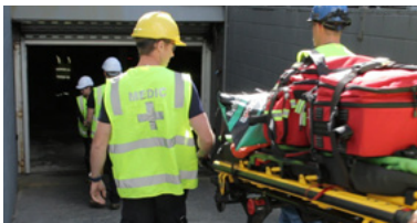
Private Company Medic