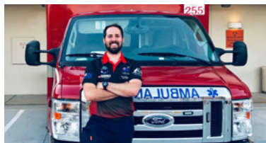
Ambulance Patient Transport Officer