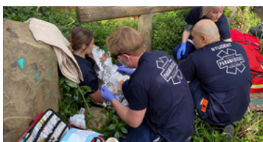
Paramedic (via a university pathway)

Here are some of the most popular career outcomes :