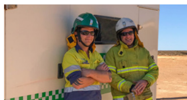
Medical Emergency Services Officer (ESO)