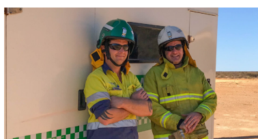
Medical Emergency Services Officer (MESO)