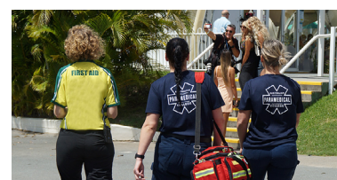
Event Medic/Emergency Medical Technician