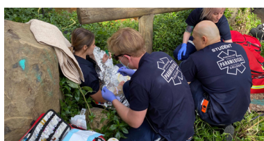
Paramedic (via a university pathway)

Here are some of the most popular career outcomes :